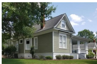
N. Florida St