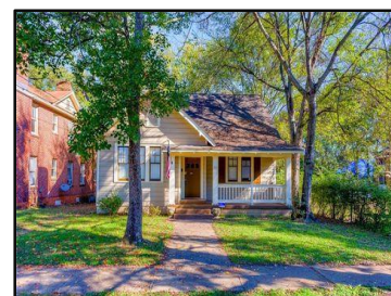
N. Capitol Pkwy