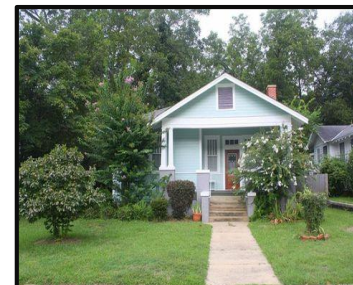
S. Capitol Pkwy