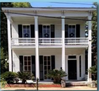
440 Clayton Cottage Hill- $169,000 Built in 1900