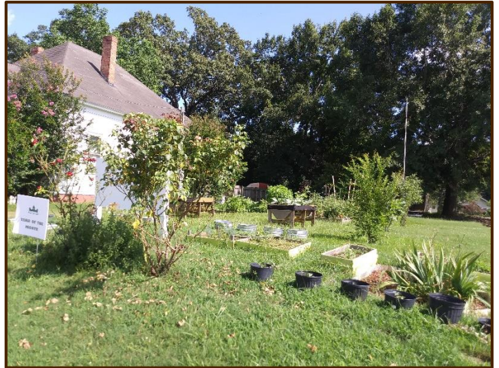
Community Garden on Winona Avenue