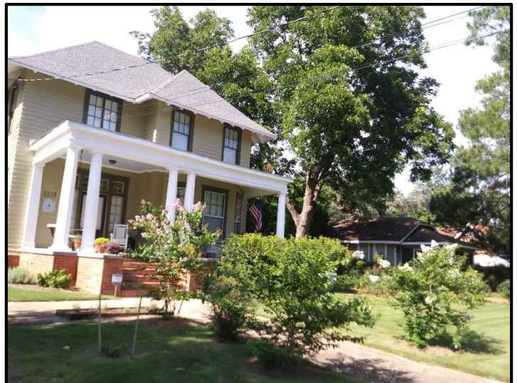
2215 Winona Avenue

Yes, it's hot, but you can still be a gardener whose yard could earn Yard of the Month. The first week of each month, make sure your lawn is tidy and that your garden [in-ground or pots, extensive or compact] adds a punch of color and interest. [And ditch the plastic flowers!]