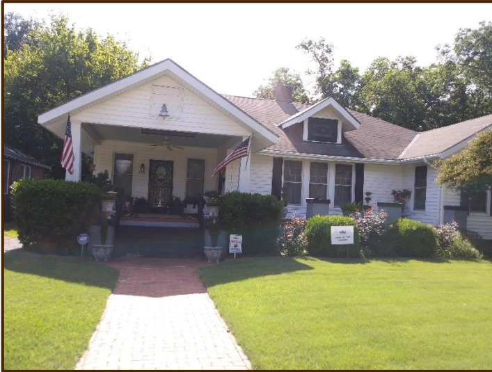
148 S. Madison Terrace