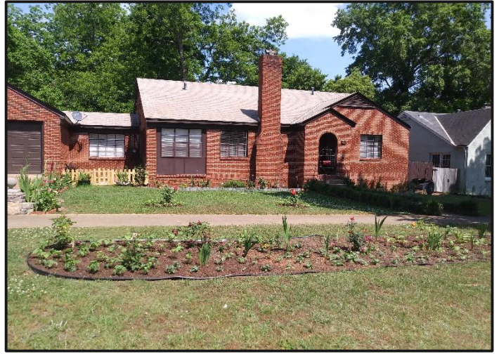
26 N PENNSYLVANIA AVE