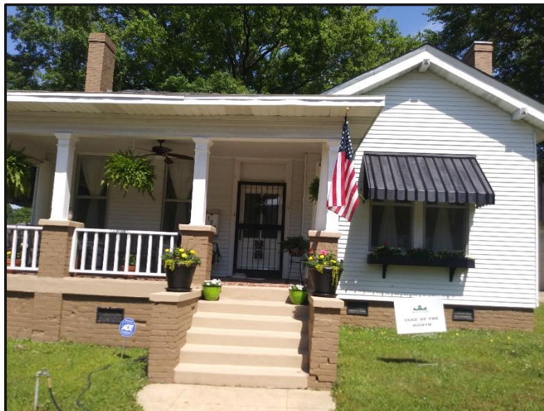
103 S CALIFORNIA ST

A BIG CONGRATULATIONS to all these homeowners who have greatly improved their landscape and curb appeal. We know the work is hard, but you have made a difference in CAPITOL HEIGHTS!! Thank you!!