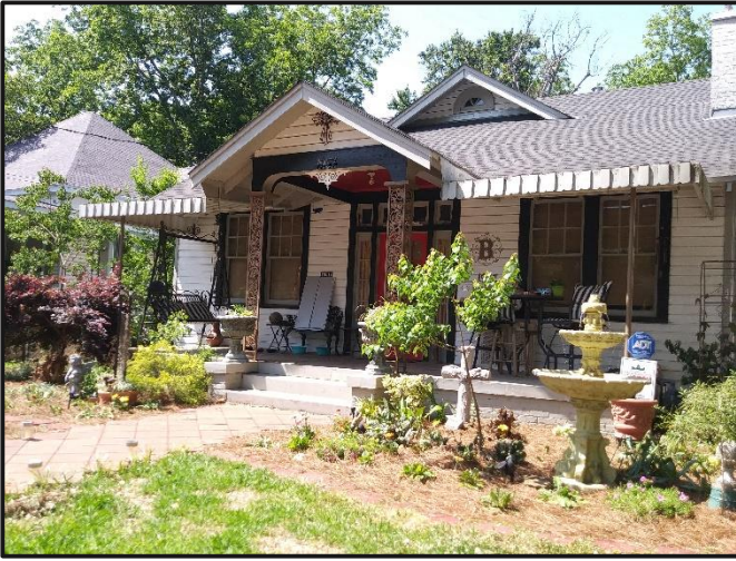
1933 WINONA AVE